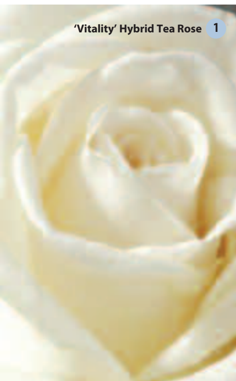
'Vitality' Hybrid Tea Rose 1

■ Spray Carnations (20- to 24-inch stems): ' Fleurette ' (7) is pink with a traditional, rose-like scent, while ' Melissa ' (8), a white and lilac variety, has a sweeter fragrance. Deeply hued and romantic, ' Satisfaction ' (9), a cherry-colored pick, smells fruity.