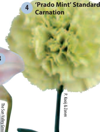
'Prado Mint' Standard Carnation 4