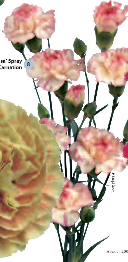
'Melissa' Spray Carnation 8