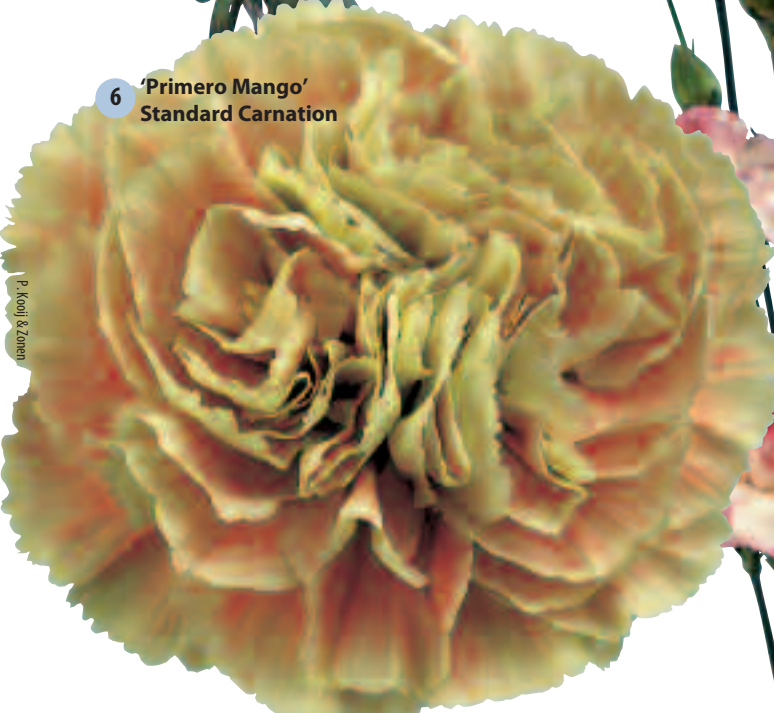
6 'Primero Mango' Standard Carnation