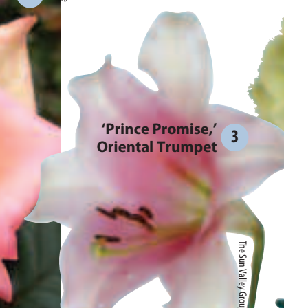
'Prince Promise,' Oriental Trumpet 3